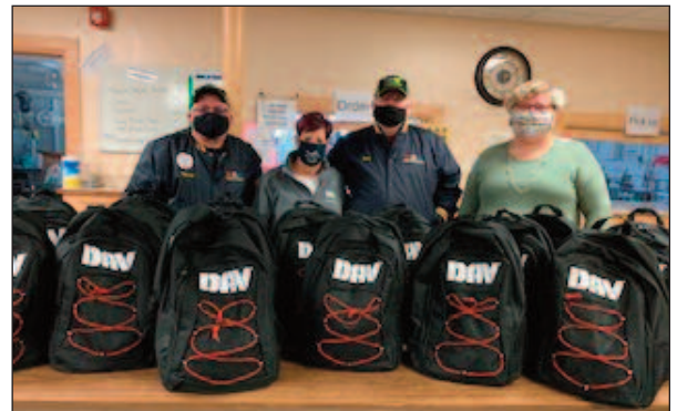
"DAV Chapter 17 and Unit leadership provided backpacks that were donated for homeless Veterans using services at the Day by Day Warming Shelter in Oshkosh."

NO MEETING IN NOVEMBER NO CHRISTMAS PARTY IN DECEMBER NEXT MEETING JANUARY 26, 2021 (Hopefully) Marine Corps League 4715 Sherman Rd. Oshkosh, WI