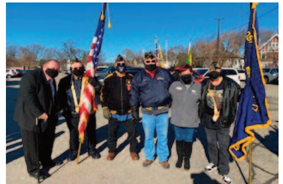
"DAV Chapter 17 and Unit members participate in the 2020 Veterans Day ceremony in Oshkosh."

Thanks to everyone that helped out with the brat frys and the FMN drives this year.